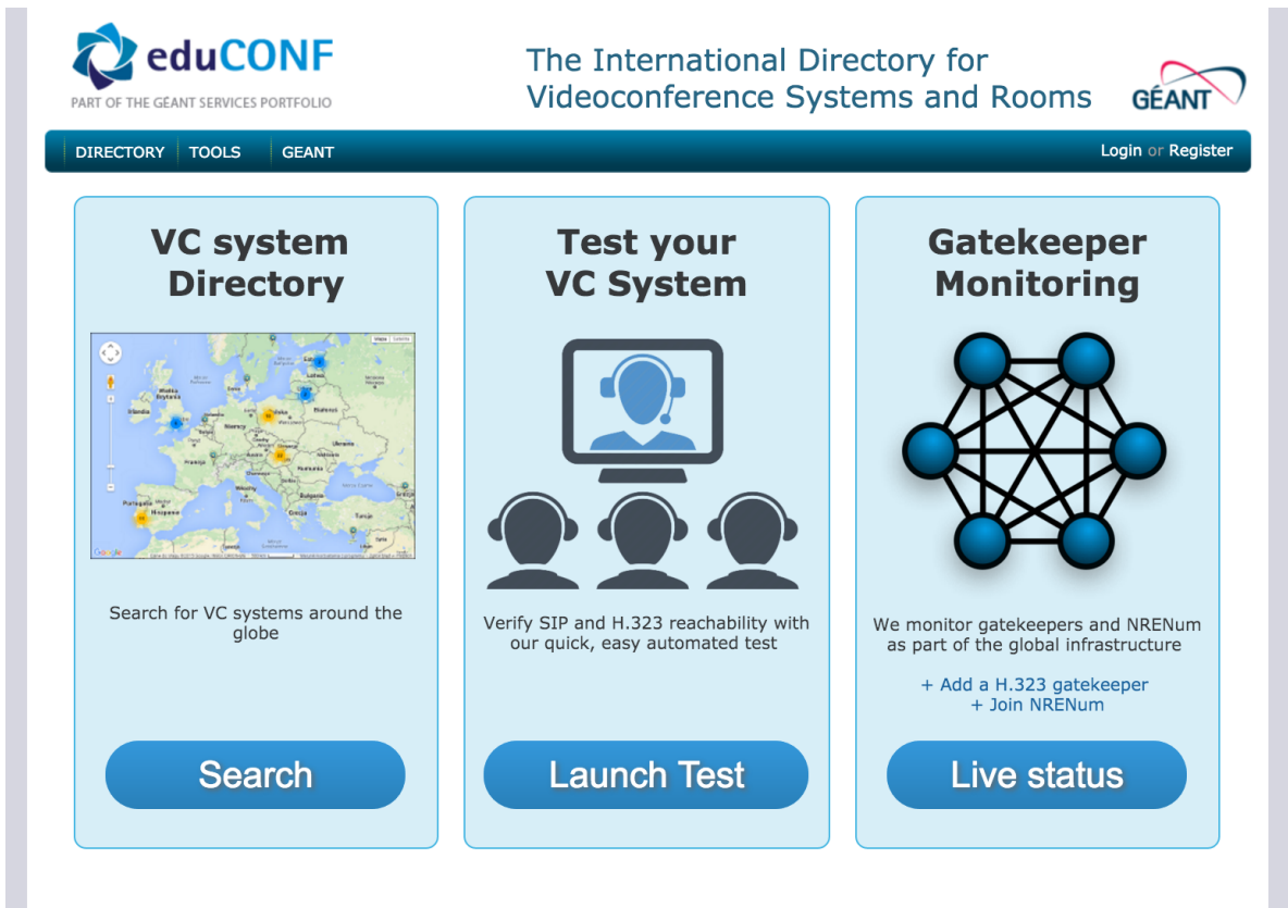
Figure 3.4: Simplified landing page clearly showing the three main service features